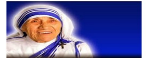
Not all of us can do great things. But we can do small things with great love.

Please help up to grow our Parish into a community of friends who know, love and serve the Lord.