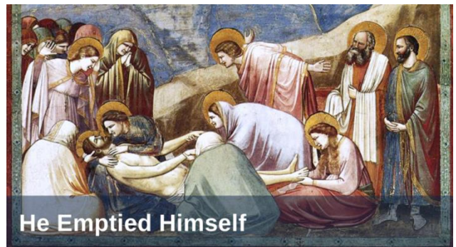
He Emptied Himself

© The scriptural quotations are taken from the Jerusalem Bible, published and copyright 1966, 1967 and 1968 by Darton Longman and Todd Ltd and Doubleday & Co Inc, and used by permission of the publishers. The English translation of the Psalm Responses, the Alleluia and Gospel Verses, and the Lenten Gospel Acclamations, and the Titles, Summaries, and Conclusion of the Readings, from the Lectionary for Mass © 1997, 1981, 1968, International Committee on English in the Liturgy, Inc. All rights reserved. The prayers are from the English Translation of the Roman Missal © 2010 International Committee on English in the Liturgy Inc. (ICEL). All rights reserved